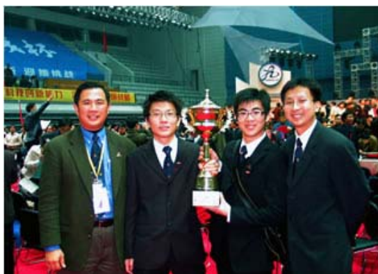
Third Award of the 9th Challenge Cup held in Fudan University, ShangHai