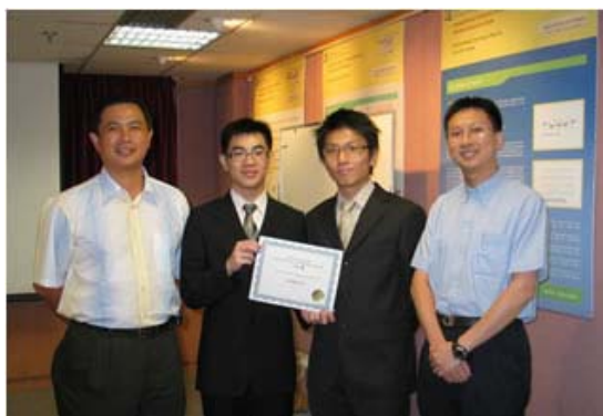
Champion of IEEE(HK) Computational Intelligence Chapter FYP Competition 2005

Homepage of IEEE(HK)CIC: http://www.comp.hkbu.edu.hk/~hknc/